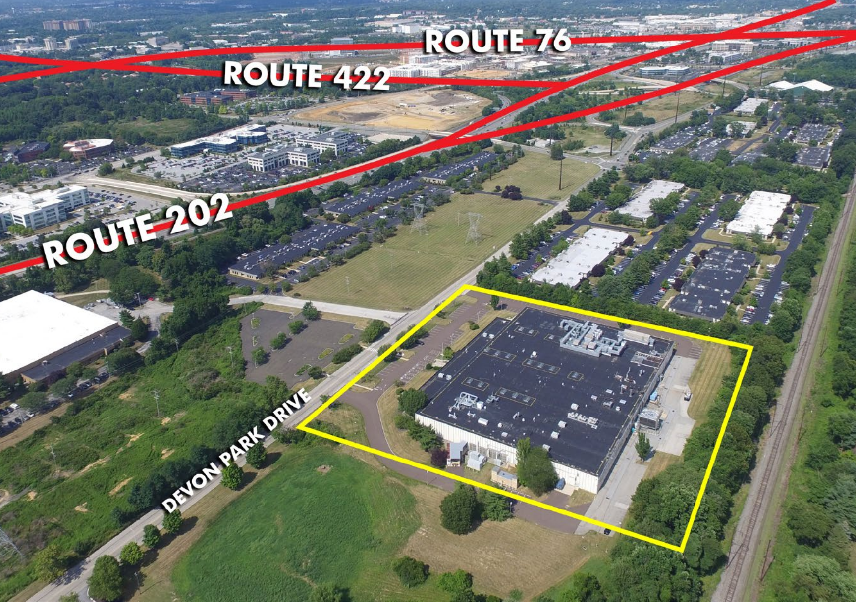
Unbelievable location in Suburban Philadelphia